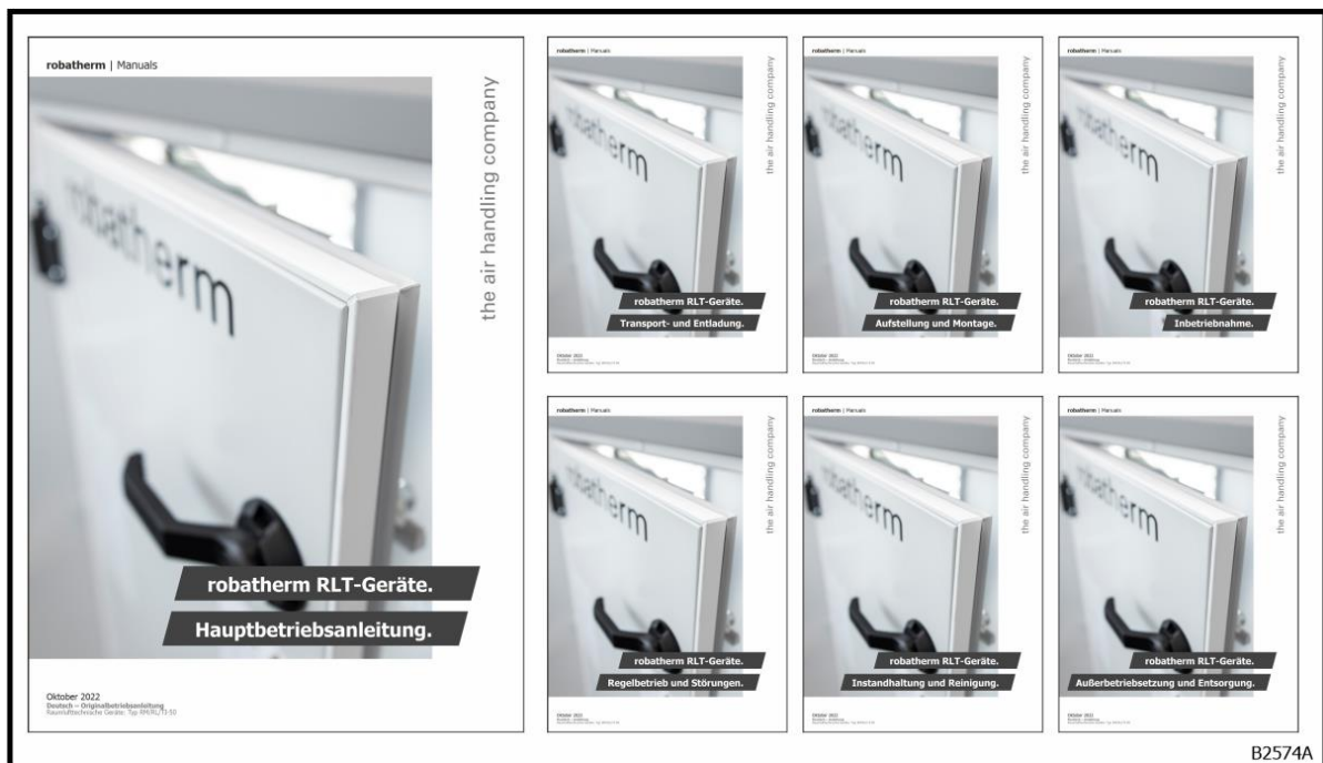
Fig. 1: Parts of the instructions

The instructions consist of several parts and have the following structure: